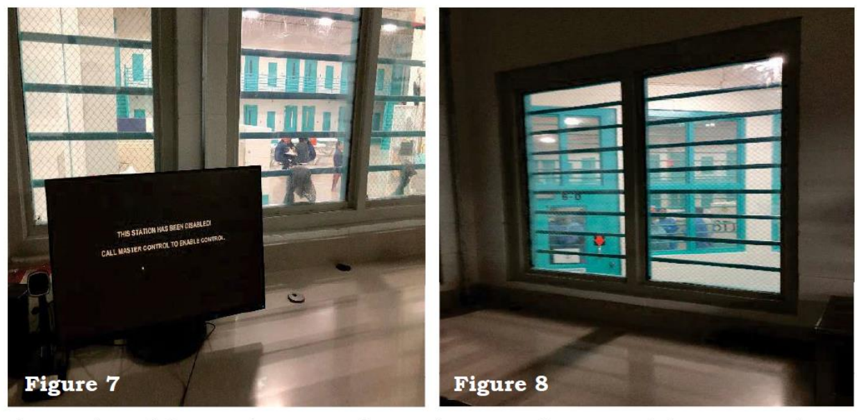
Figures 7 and 8. Detainee Housing Unit Control Room without Posted Officers (left) and with Poor Sight Lines through Barred and Dirty Windows (right)