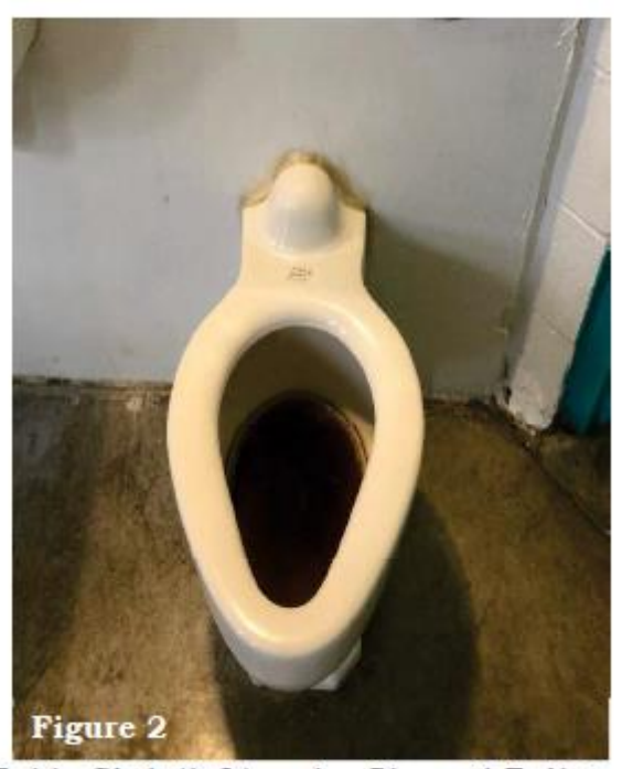
Figures 1 and 2. A Non-Functioning, Moldy Sink (left) and a Clogged Toilet Full of Human Waste (right) Observed in Vacant Cells in an Occupied Housing Unit