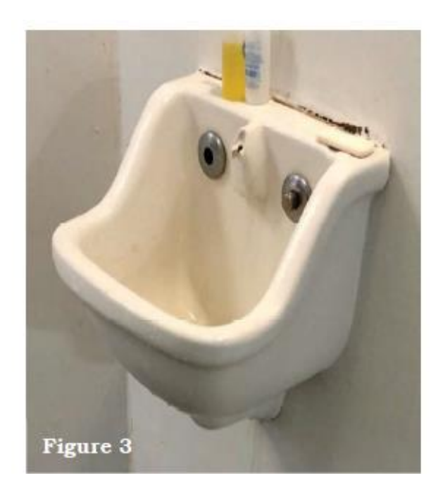
Detainee Cell Sink with Missing Hot Water Button