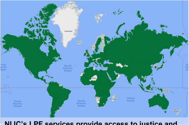
NIJC's LPF services provide access to justice and stability for Black, Brown, Indigenous, and other immigrants who have come to Chicago from all over the world.